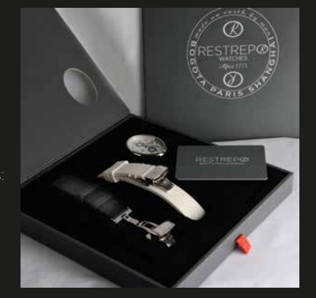
100 Pieces - Numbered -