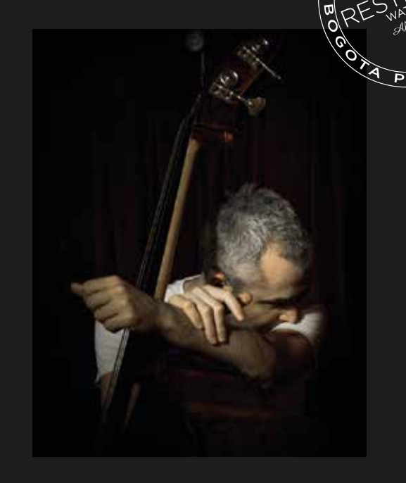
The Gent's Brand that the women adore