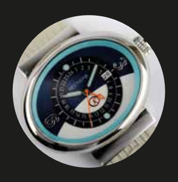
Enamel Dial - Fixed parts Genuine hands Swiss Hard Luminova Blue