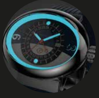
Saphire Double sides Mvnt HZ 6140 Rotor signed